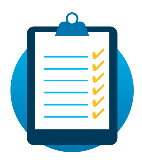
Public Policy User